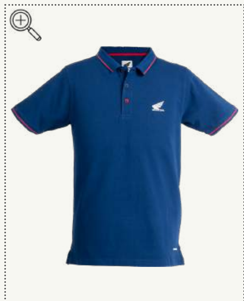
BLUE POLO SHIRT