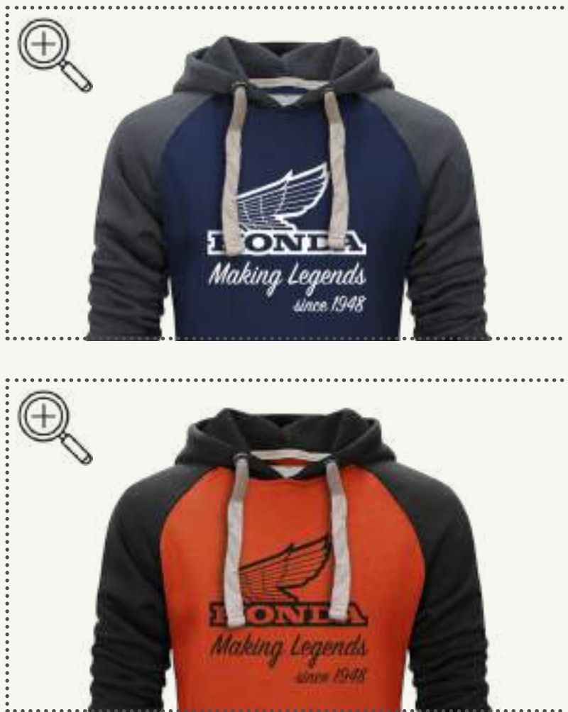
MAKING LEGENDS HOODIES