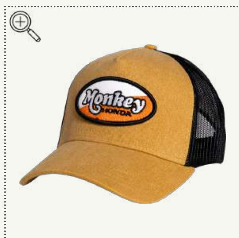
MONKEY TRUCKER CAP