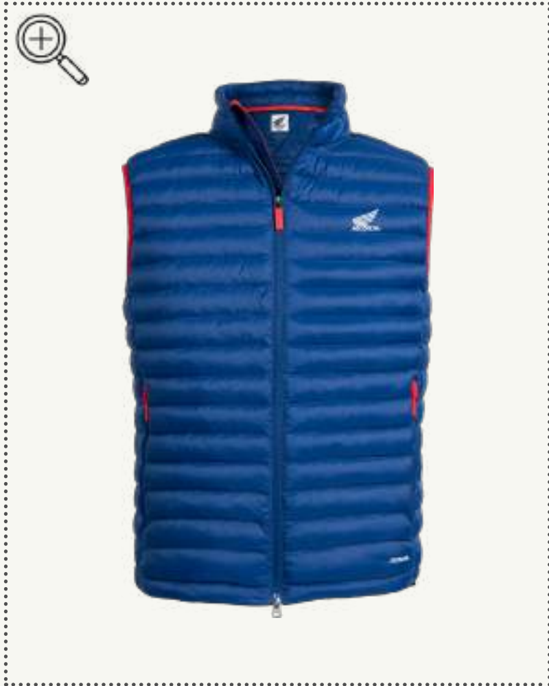
BLUE PADDED VEST