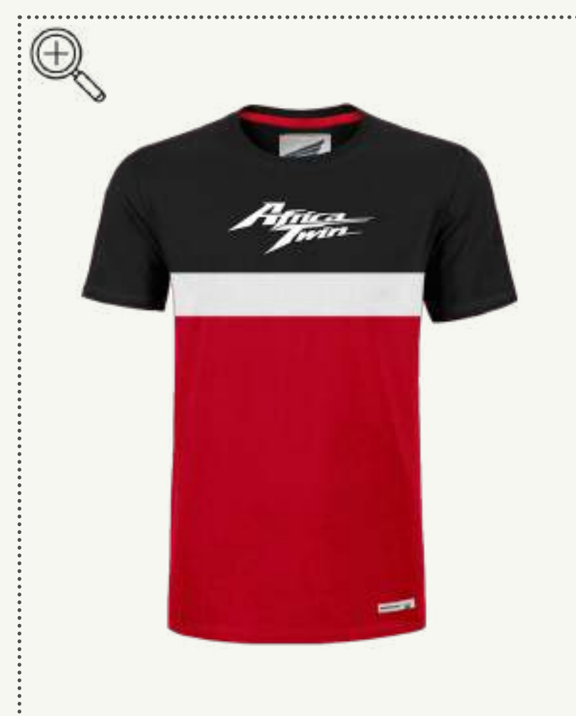
AFRICA TWIN T-SHIRT