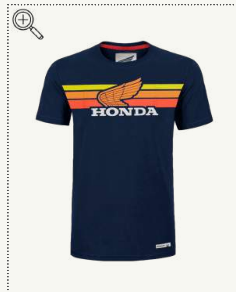
SUNSET NAVY BLUE T-SHIRT