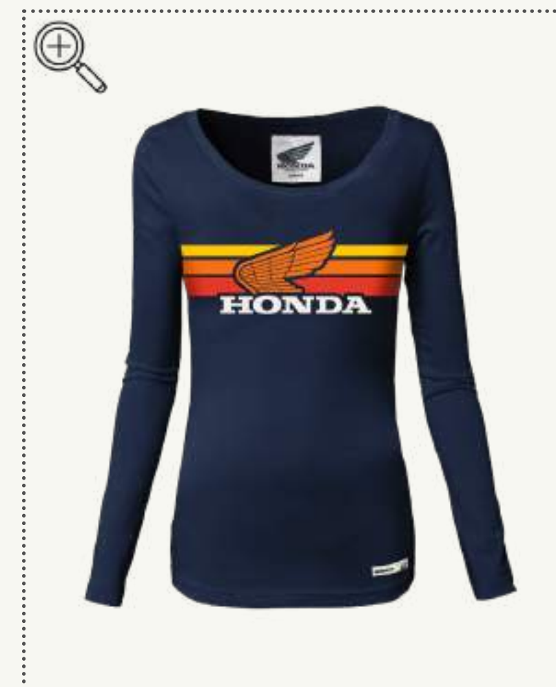
LADY SUNSET T-SHIRT