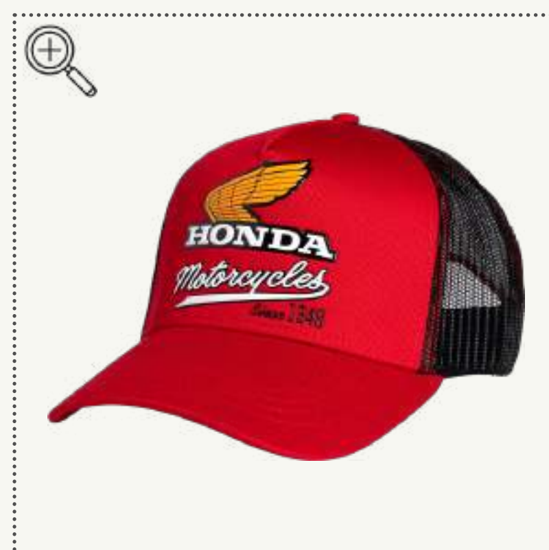
ELSINORE TRUCKER CAP