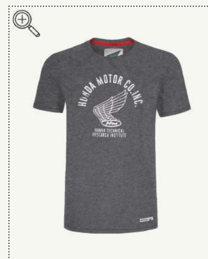
TECHNICAL RESEARCH T-SHIRT