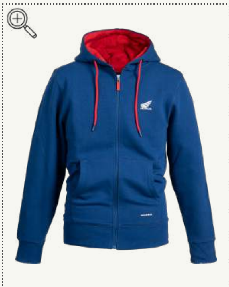
BLUE ZIP HOODIE