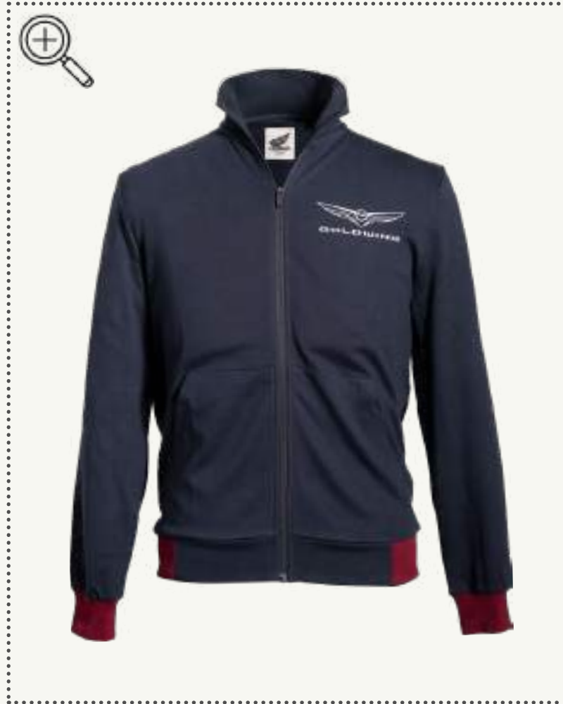
GOLD WING FULL ZIP